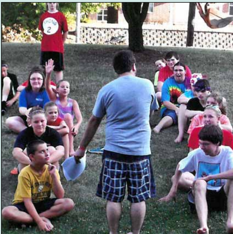
Above: First United Methodist Church of West Plains received a Spring 2011 grant used to fund a summer intern to help their children and youth programs.