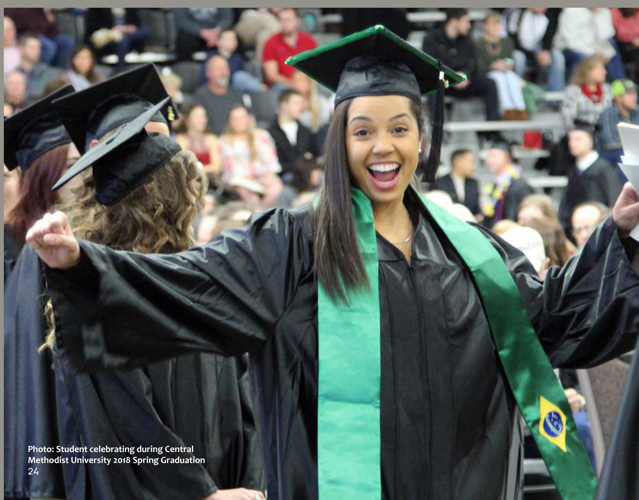
Photo: Student celebrating during Central Methodist University 2018 Spring Graduation