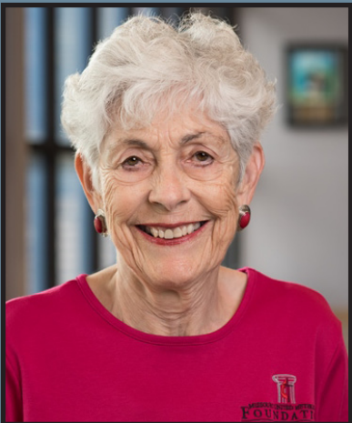
Linda Mary Neal Foundation Representative