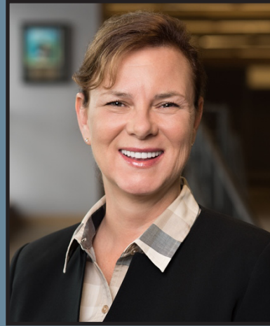
Monett Lite Director of Operations/CFO