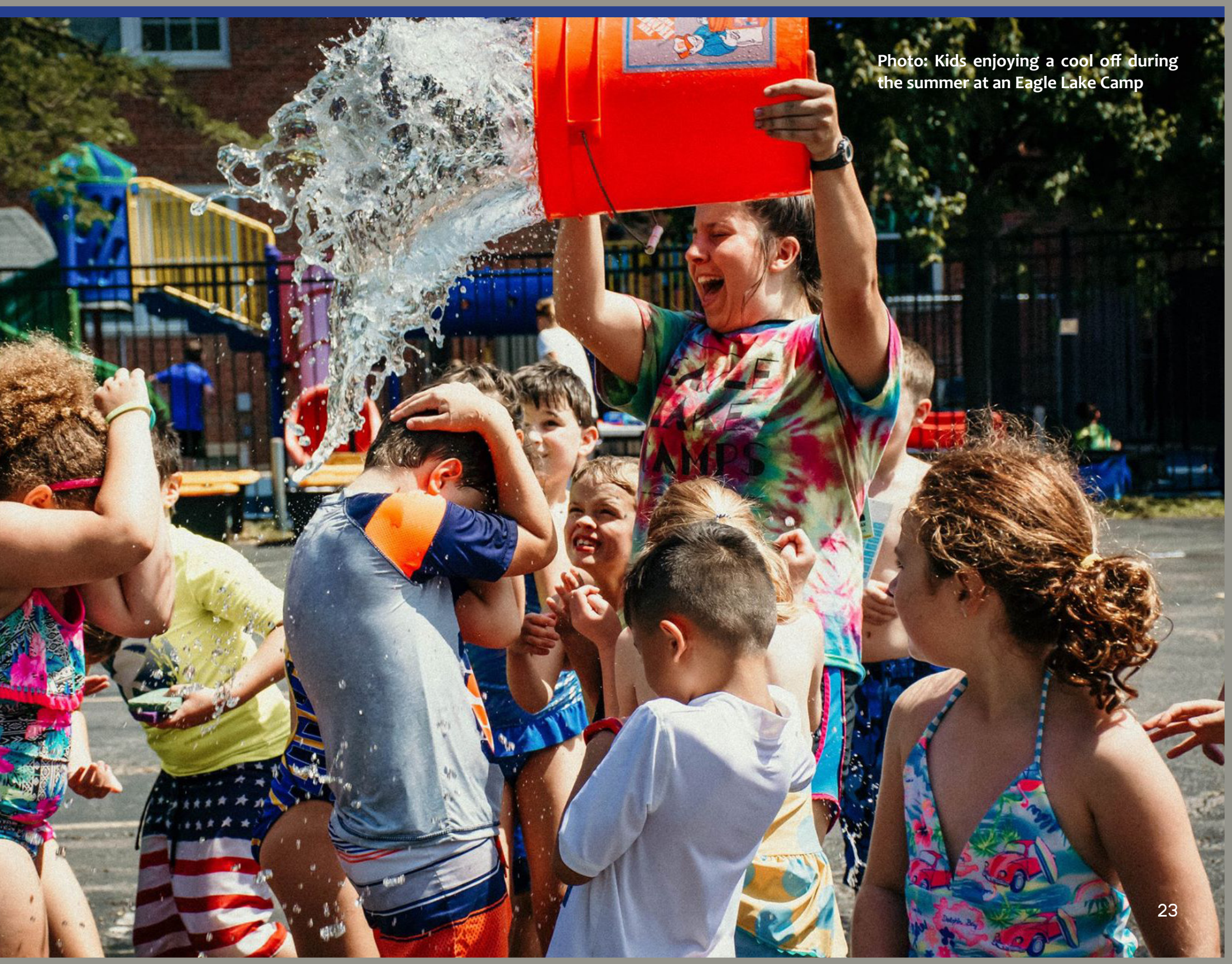
Photo: Kids enjoying a cool off during the summer at an Eagle Lake Camp