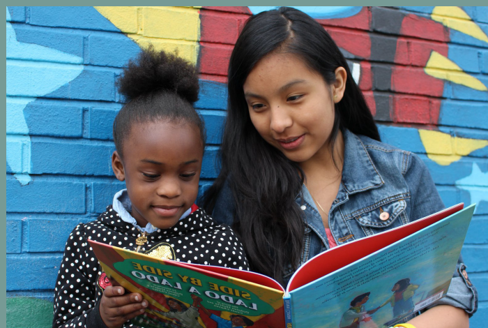
Kingdom House Summer Reading Program