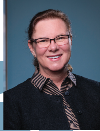
Monett Lite Director of Operations/CFO